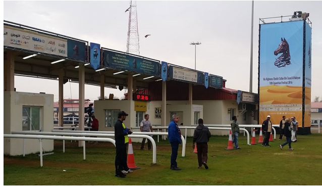
6- Judges and stewards ready to handle the flow of competitors to come