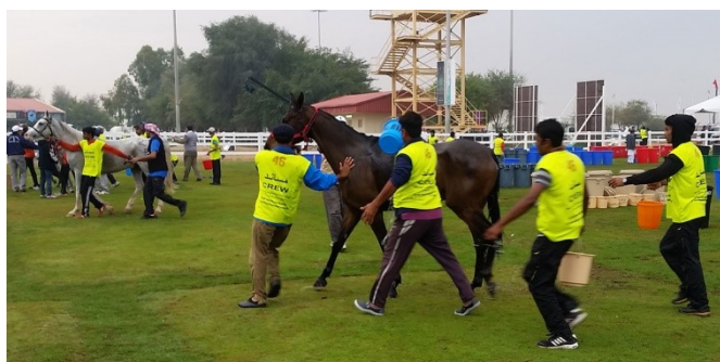
5- Identified grooms with the number of the horse they are in charge of, in a number duly controlled by the Ground Jury.

The Ground Jury was carefully selected– with some unfortunate exceptions - so that its members were competent, organized, strong and effective. In Bouthieb we no longer saw crowd movements overwhelming the jury during arrivals. Multiple grooms "encouraging" horses with their empty bottles on the track were no longer seen, etc. It proves that the international regulations can be implemented with Ground Jurys composed of a majority of competent members and that it is possible to apply and enforce them everywhere if we really want to.