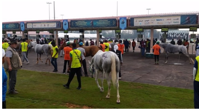
8- An inspection area controlled even during dense moments. One rider and one groom per horse, all of them being clearly identified with the number of the horse they accompany, waiting for their turn automatically displayed on the line screens.

"We have yet to see horses kill themselves voluntarily on the track." This sentence heard in response to some statements made at the seminar where some argued that fatalities are an inevitable side effect of high performance sport goes well with one of the first objectives aimed at this year. It appears, on this occasion, that we do not all have the same concept of what is called top sport endurance, which once more asks the fundamental question of progression and instruction, of horses as well as of men, in the current qualification system. It also poses a problem concerning the internal vision of the UAE between the 3 organizing sites and it seems in this end of season that a deep schism is to be expected. It is hoped that it will find a positive way out for horses and sport.