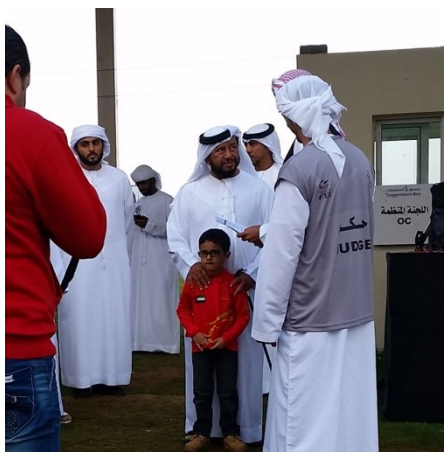
1- HH Sh Sultan bin Zayed Al Nahyan at the entrance of the inspection area during one of his many visits.