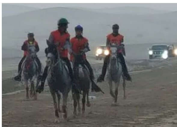
4- End of the 4WD gymkhana.