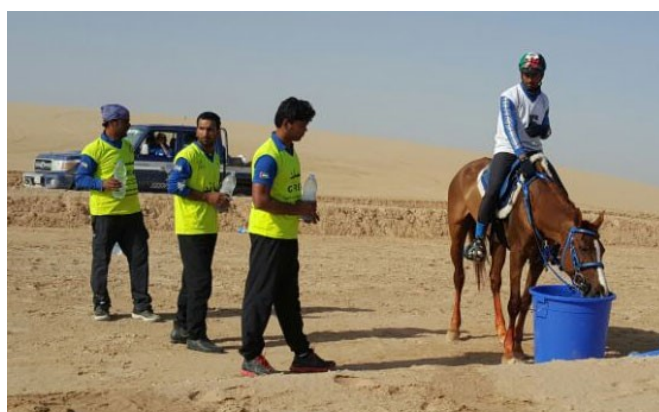
3- A horse drinking on the track with grooms waiting before acting.