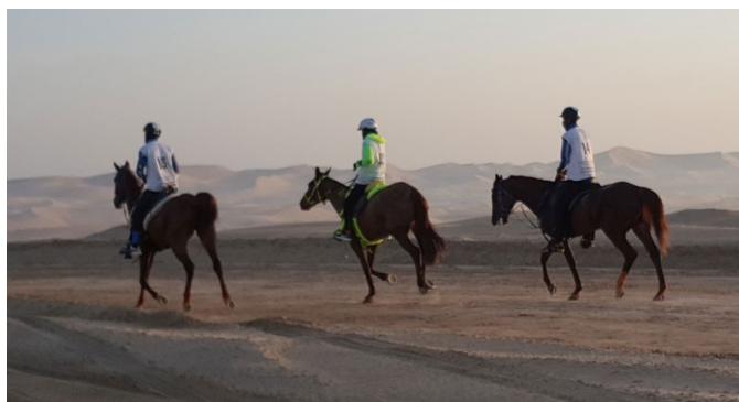
2- Horses trotting on the track.